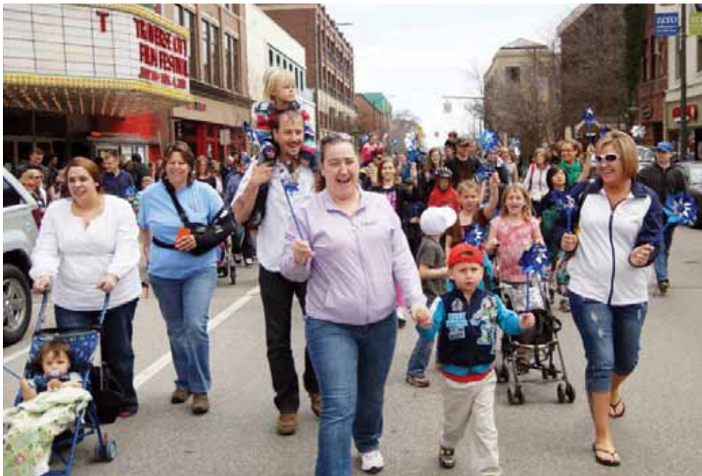
Participants march at the 3rd Annual Zero Tolerance Event.

Wake up from the illusion of child abuse every morning with a cup of Michigan STRONG coffee. Roasted in Traverse City, $5 from each bag sold goes directly to the TBCAC. Visit Higher Grounds Trading Company online or call 231.922.9009 for bulk quantities.