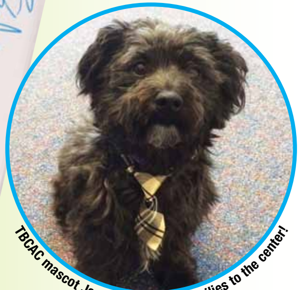
TBCAC mascot Jeeves welcomes families to the center!

A world where children are safe from abuse and neglect.